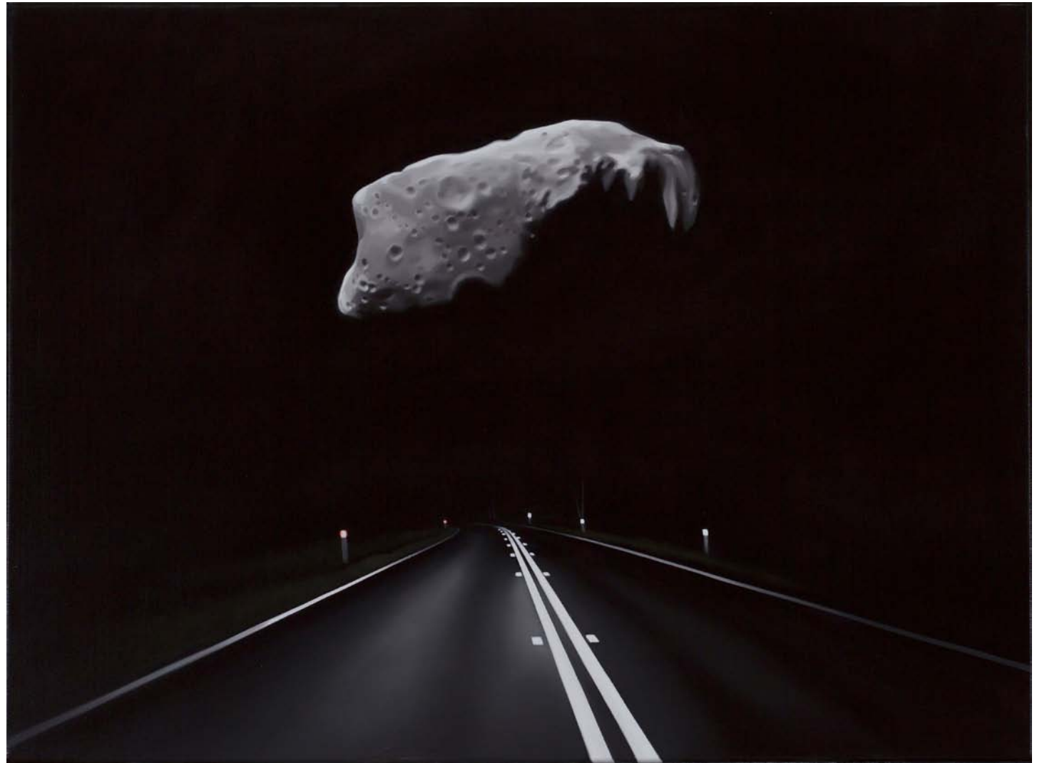
Near Earth asteroid with highway (Ida) 2017 oil on linen 45 × 61 cm $4,000