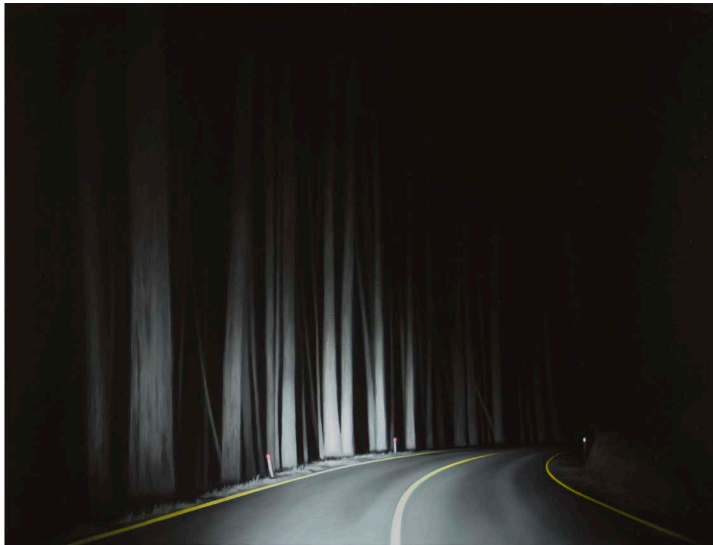
High Plains Road 2017 oil on linen 40 × 30 cm $4,000 SOLD