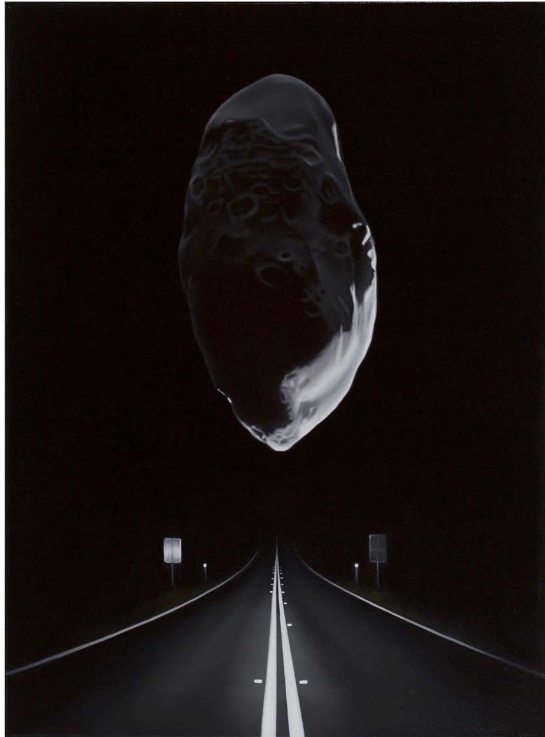
Near Earth asteroid with highway (Prometheus) 2017 oil on linen 61 × 45 cm $4,000