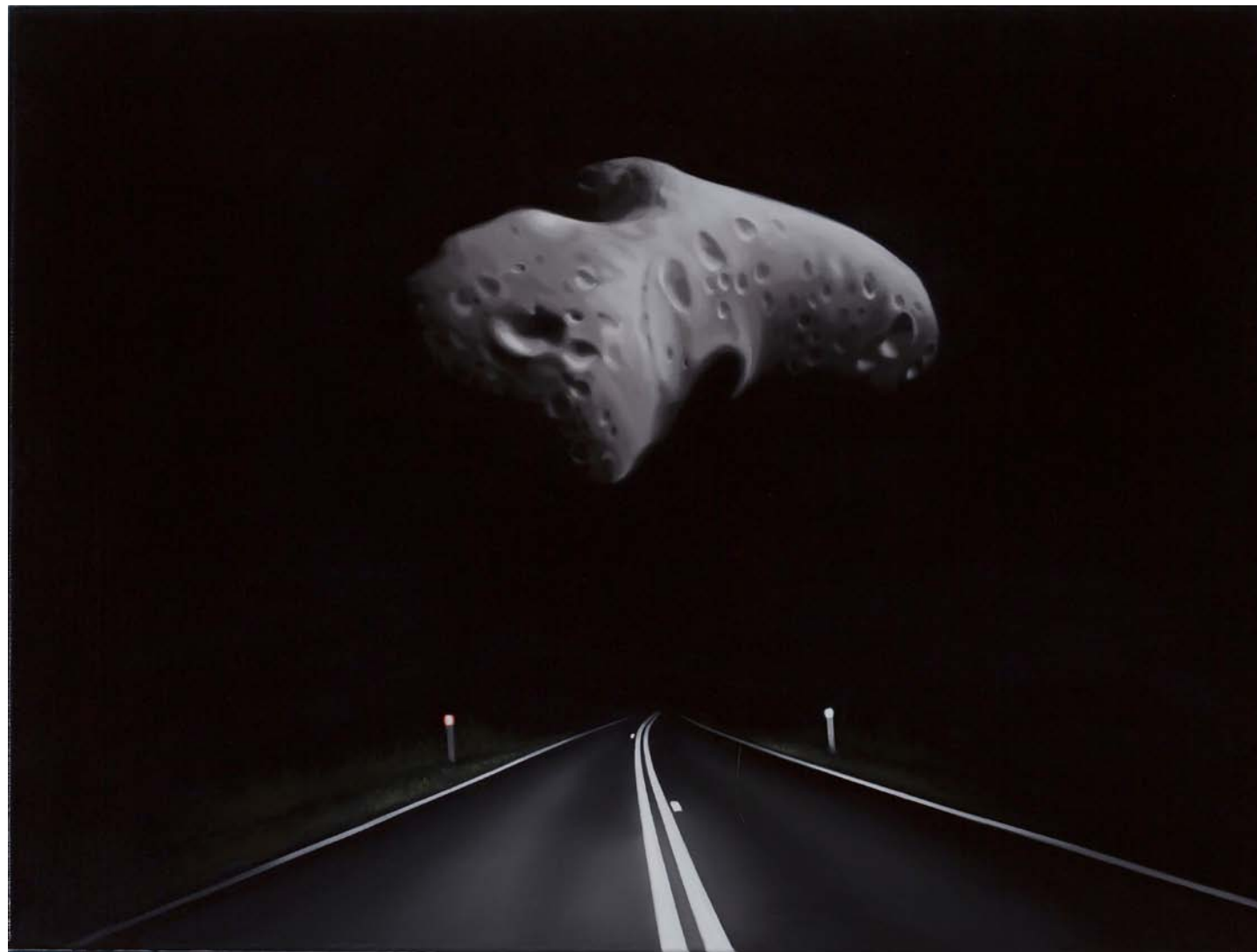
Near Earth asteroid with highway (Eros) 2017 oil on linen 45 × 61 cm $4,000