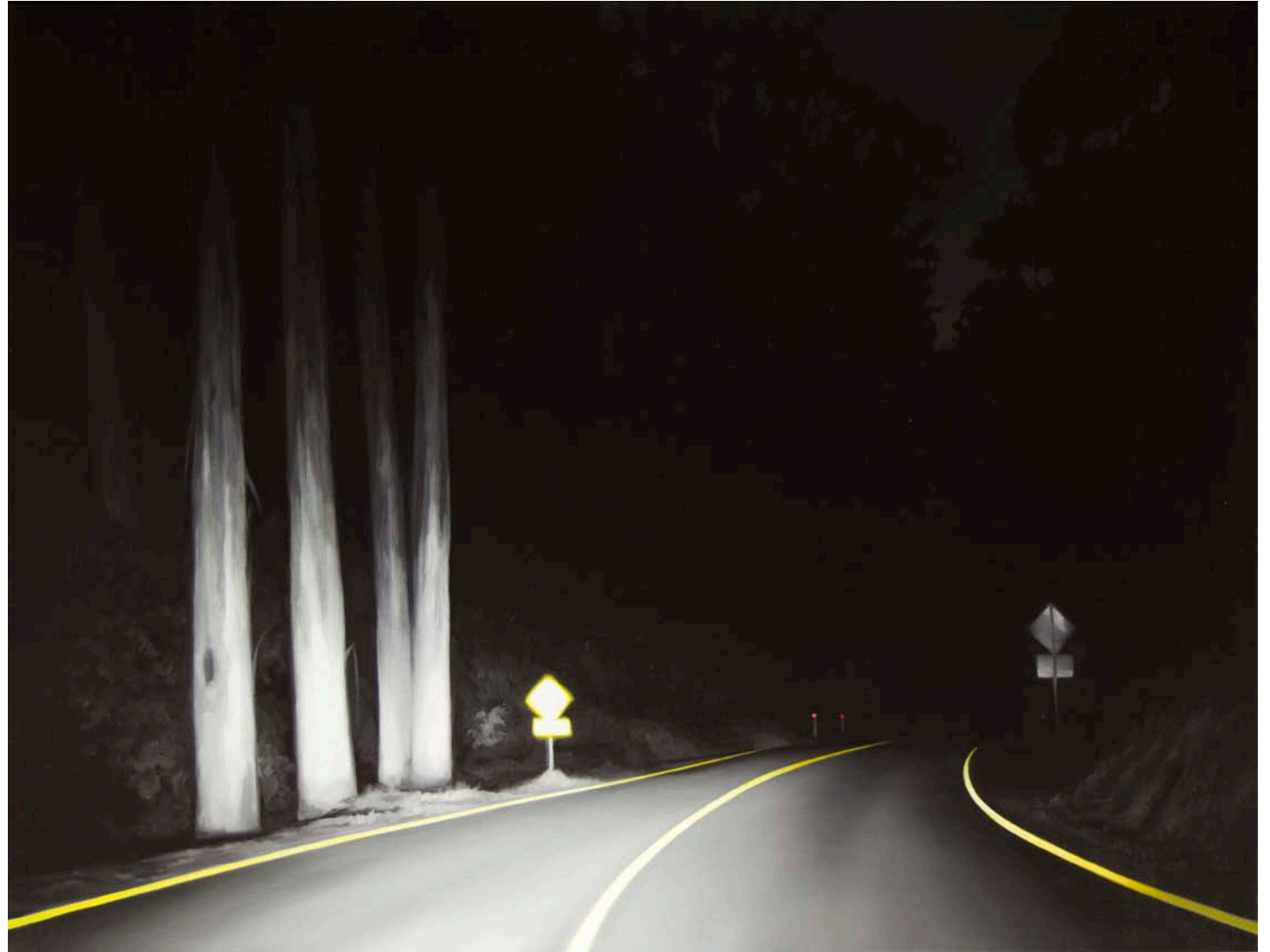
Bogong Road 2017 oil on linen 40 × 30 cm $4,000