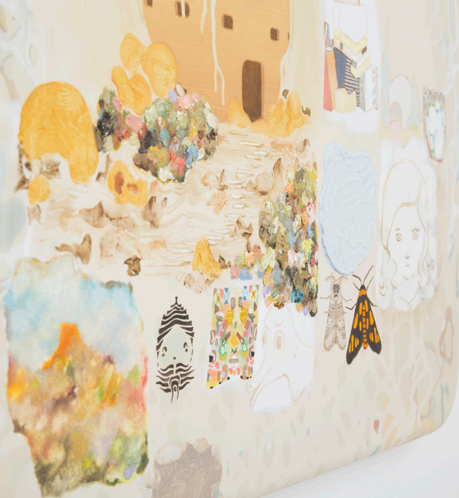
The Roundhouse (detail) 2017 acrylic and oil on wood panel 50 × 45 cm $2,500