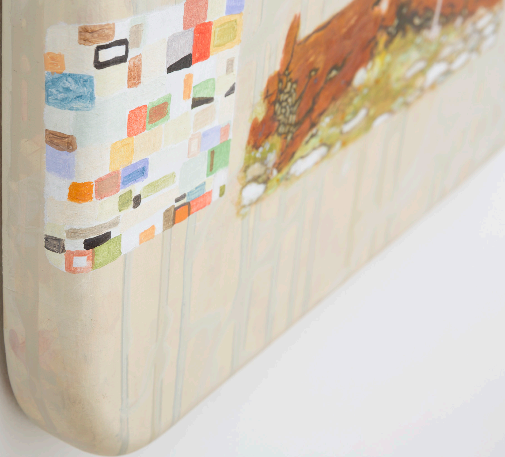
Estuary Lookout (detail) 2017 acrylic and oil on wood panel 50 × 45 cm $2,500