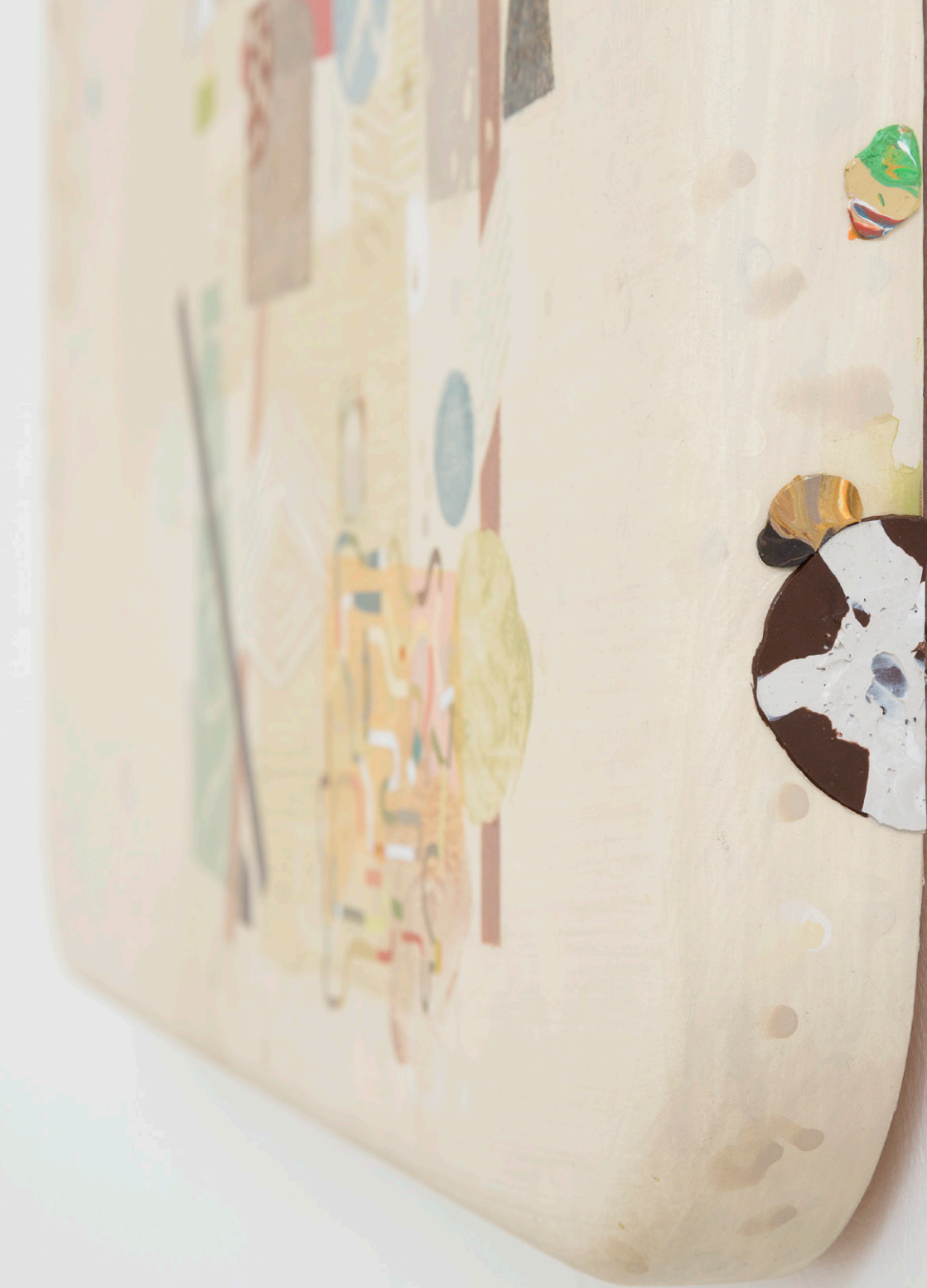
Pre-Industrial Mechanism (detail) 2017 acrylic and oil on wood panel 50 × 45 cm $2,500