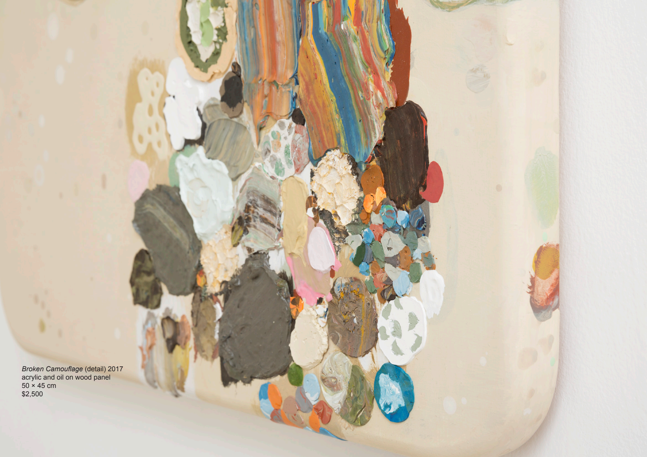
Broken Camouflage (detail) 2017 acrylic and oil on wood panel 50 × 45 cm $2,500