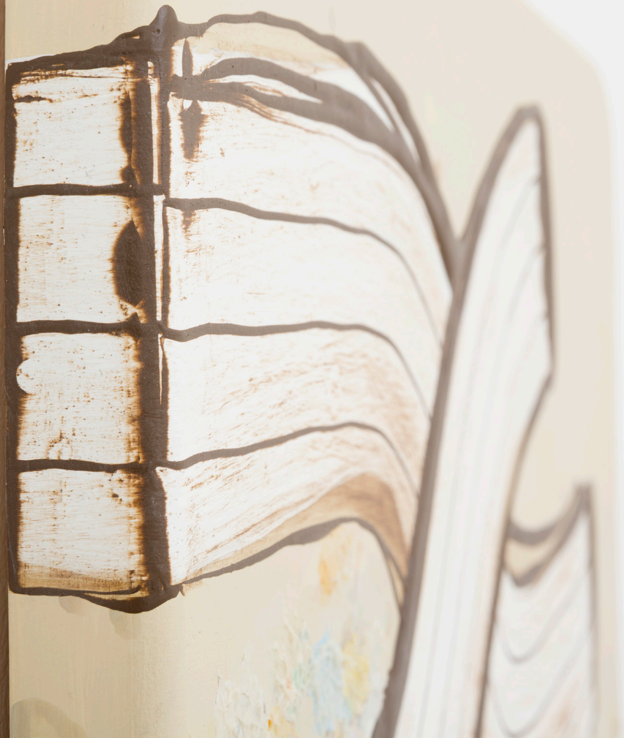
Liverwort Protectorate (detail) 2017 acrylic and oil on wood panel 50 × 45 cm $2,500