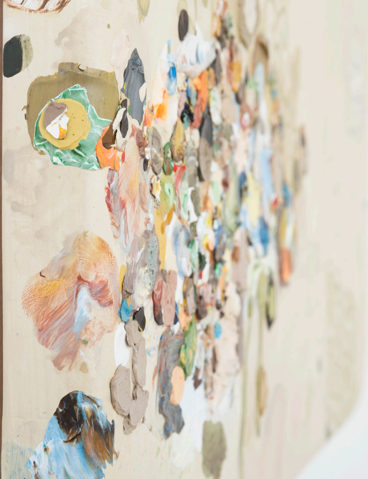
Amber Bulwark (detail) 2017 acrylic and oil on wood panel 50 × 45 cm $2,500